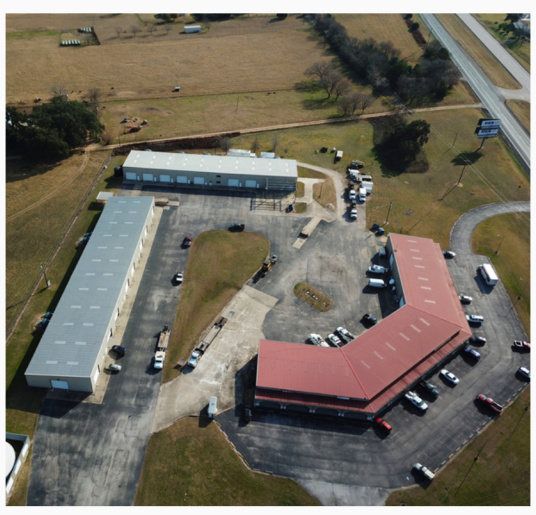
Corner Lot on 10 acres