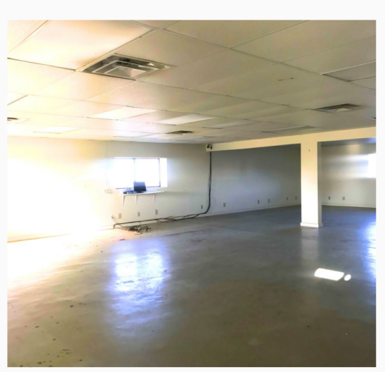
Approx. 1,995 sq. ft.