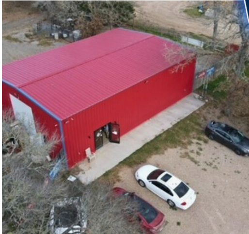
HIGH TRAFFIC AREA