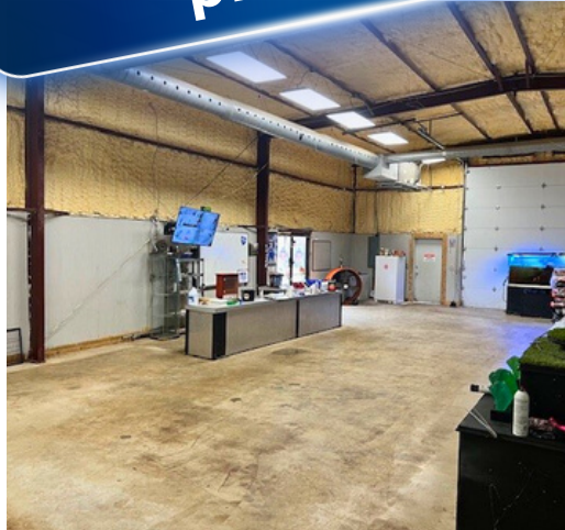
2,400 SQ FT MAIN BUILDING