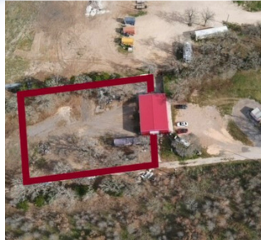
FENCED & GATED YARD SPACE