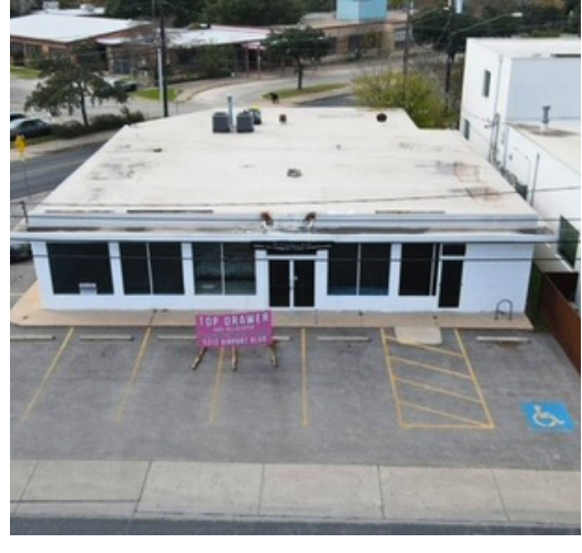
HIGH TRAFFIC CORNER LOT